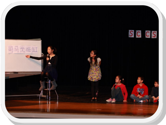
Chinese Class 4A — Simaguang Breaks the Vat