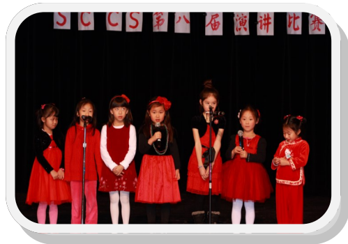
Chinese Class 1A Nursery Rhymes Recitation