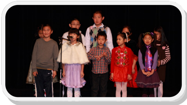
Chinese Class 4A — Make A Guess