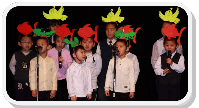
Chinese Class 1B — Little Bird Freely Fly